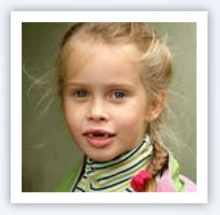
"We know from years of experience and scientific study that community water fluoridation benefits everyone. The ADA has long advocated water fluoridation as the single most effective public health measure to prevent tooth decay."