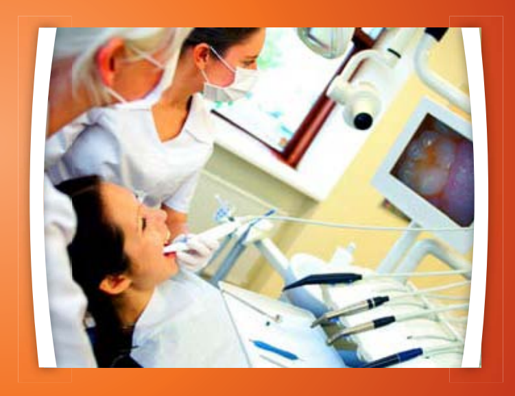
Source: Centers for Disease Control and Prevention, 2009 "ORAL HEALTH Preventing Cavities, Gum Disease, and Tooth Loss"

Tooth decay affects more than one-fourth of U.S. children aged 2-5 and half of those aged 12-15. About half of all children and two-thirds of children aged 12-19 from low income families have had decay.