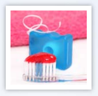
Tooth decay is five times more common than asthma and seven times more common than hay fever.

Source: Centers for Disease Control and Prevention, 2009 "ORAL HEALTH Preventing Cavities, Gum Disease, and Tooth Loss"