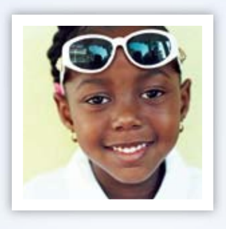
While 9 million children lack health insurance coverage, more than 20 million children are not covered for dental services.

Source: The Kaiser Commission on Medicaid and the Uninsured