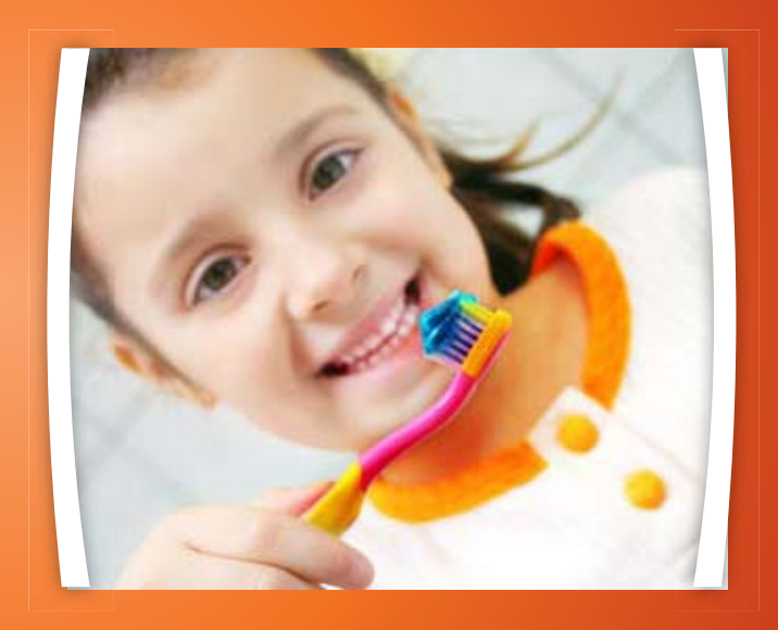
Source: Oral Health in America: A Report of the Surgeon General, 2003

The daily reality for children with untreated oral disease is often persistent pain, inability to eat comfortably or chew well, embarrassment at discolored and damaged teeth, and distraction from play and learning.