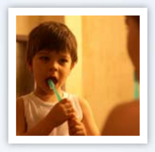
The proportion of children with protective sealants is low in Oklahoma compared to other states. Only 37.2% of Oklahoma third-graders have sealants on at least one permanent molar tooth.